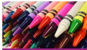
SEND Local Offer