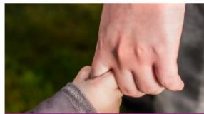
Early Help Family Support