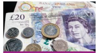
Housing and finances

The Online Family Hub has been developed to provide you with a range of different types of resources that are available to you online, on the phone or face to face that you can access directly.